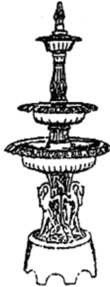
Three Tier Swan Fountain 83"H x 36" Dia #84-145B (Pump not Included) $520.00