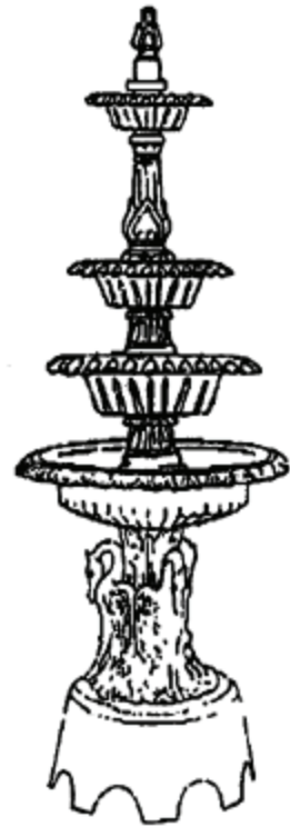
Four Tier Swan Fountain 93"H x 36" Dia #84-145C (Pump not included) $560.00