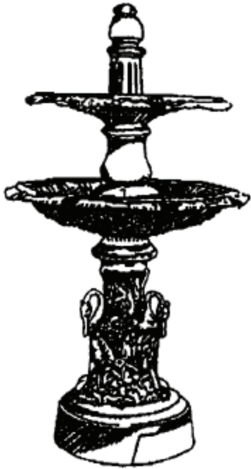
Two-Tier Swan Fountain 58"H x 36" Dia #84-145 (Pump not included) $440.00